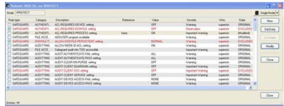
Create, view and maintain file set on the file set maintenance window

File Integrity Checker runs a wide range of reports of any changes made to critical files. Reports are run based on file sets that have been predetermined by the administrator. The user can schedule automated reports or run checks manually when required. The administrator can run detailed analysis of all protected files or choose a specific file to be checked for various activities. File Integrity Checker will report any and all modifications and the users associated with those modifications. The results can be displayed in FIC's graphic interface or sent to the print spooler. Comparisons can be run against previous reports to determine the changes between reports. The administrator has an option to check files by selecting one or many criteria at the same time.