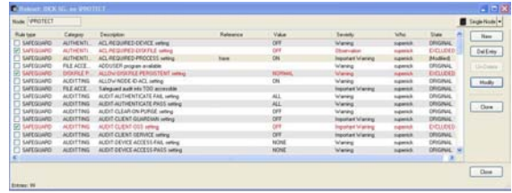
File Check Run shows failed files